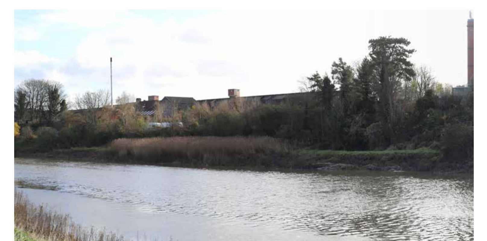
Existing view from Spike Island View 1 from Spike Island