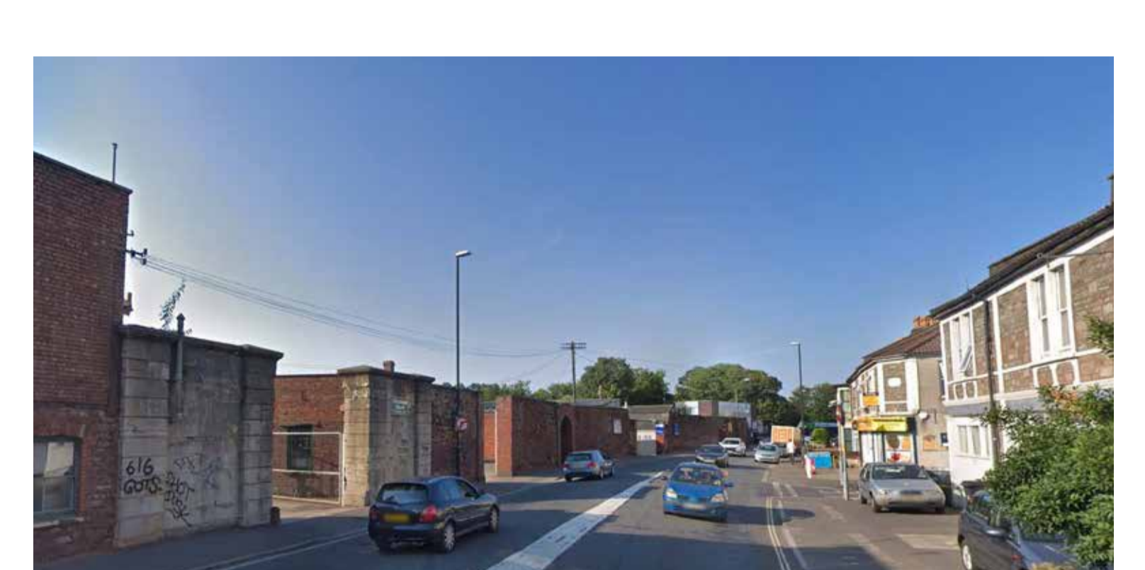
Existing view from Coronation Road View 3 from Coronation Road