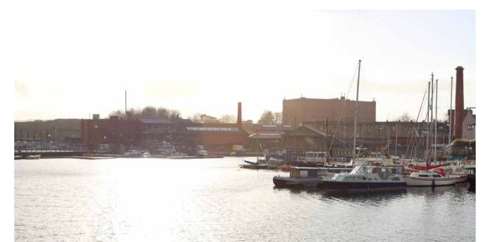
Existing view from Spike Island View 2 from Spike Island