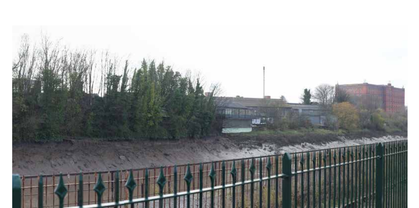
Existing view from Spike Island View 4 from Spike Island